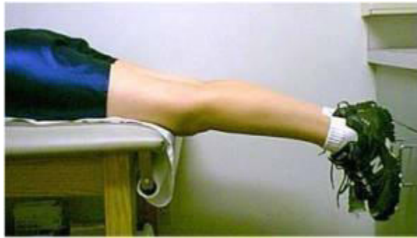
Prone Leg Hang